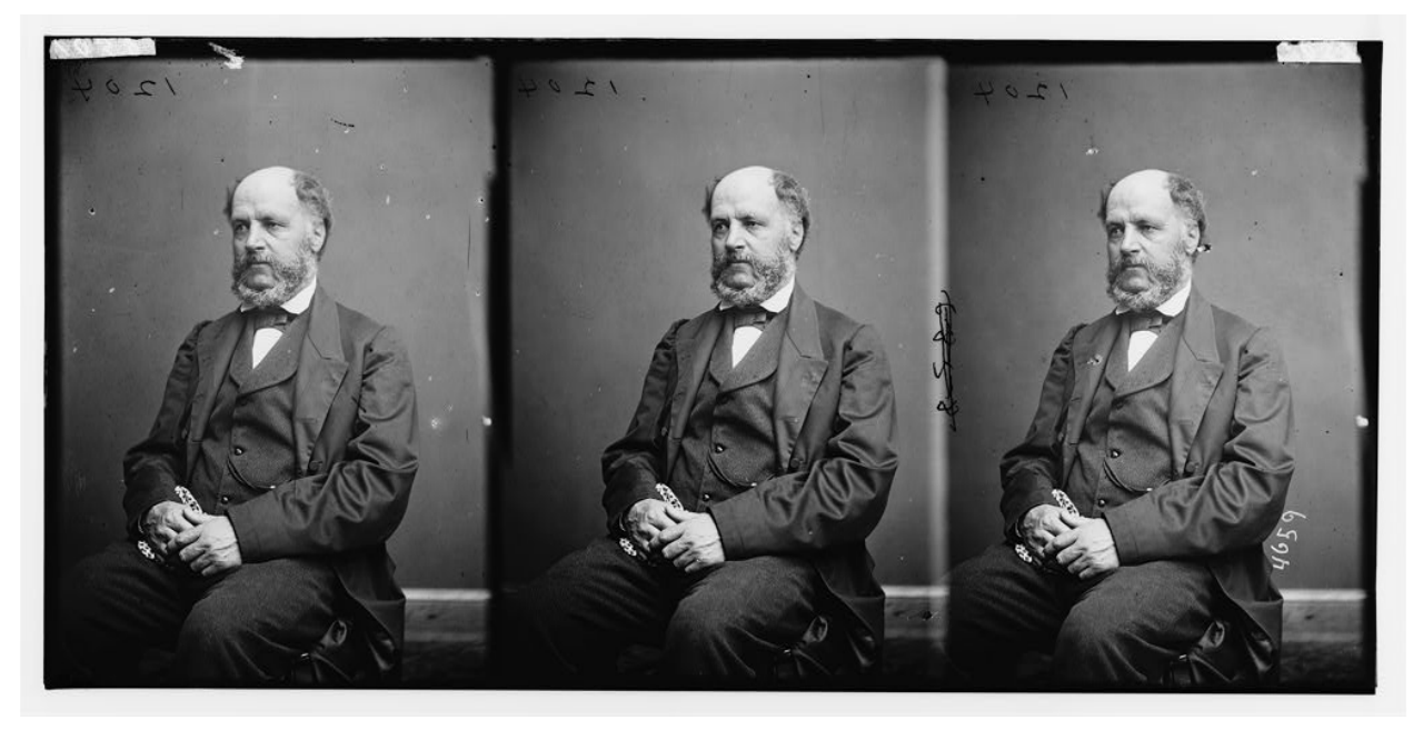
Photoprint of Charles Benedict Calvert by Matthew Brady. Library of Congress Prints and Photographs Division. LC-DIG-cwpbh-03464